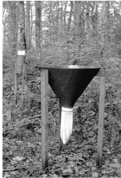
Solid funnel with bag