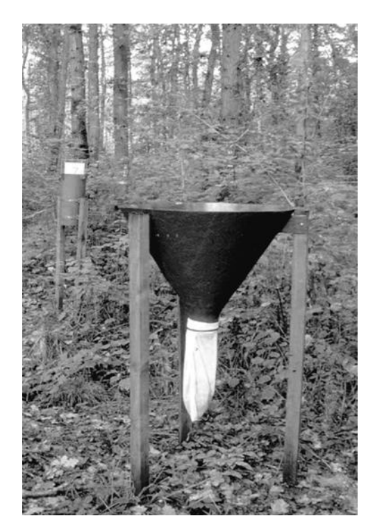
Solid funnel with bag