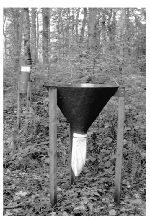
Solid funnel with bag